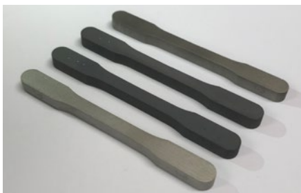
Hardened + Tempered

Specimens with subsequent process steps, bottom to top: as sintered, after hardening, after tempering and after blasting.